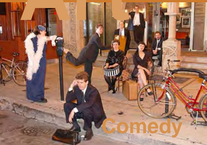
Second City Comedy Troupe